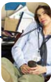
Intern Access: Copy Only