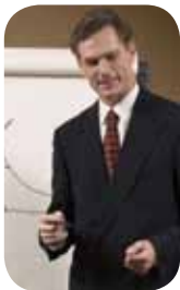
Boss Access: All Features

Walk-up copying, scanning, and faxing are all great conveniences. However, you may want to limit access to select features, especially if you are handling confidential records and data, or to restrict access to printing to keep your operating costs down. So the MFC-9840CDW provides the ability for your administrator to set various levels of password-protected access to certain features, for each of up to 25 different users per machine.